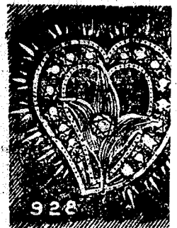
An Exceptionally Fine Brooch. The workmanship exquisite. Regular price 12/-